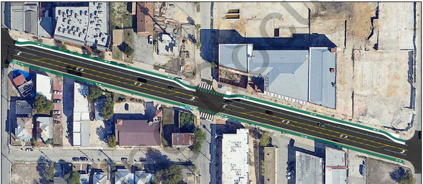
Figure 1: East Commerce Signature Project Concept

East Commerce is a major connection on the primary network on the East Side of San Antonio, connecting downtown to Salado Creek Greenway. It features an already grade-separated crossing of a rail line and most of the roadway has ample width to feature a striped bike facility without a lane reduction. It also sits on San Antonio’s Vision Zero High Injury Network. East Commerce was selected as a signature project to show how bike facilities can be deployed using new design guidance. As the roadway is an arterial and falls in a high-density area, a protected bike lane is the most appropriate facility for deployment. The existing roadway section consisted of a 75-ft right-of-way (ROW) with 42-ft Roadway (two 10-ft lanes, two 11-ft lanes) two 8-ft parallel parking lanes, and 6-ft and 11-ft Curb & Sidewalks. To accommodate the new facility, the existing section was improved to the following potential new section (75-ft ROW with 33-ft Roadway, two 11-ft lanes, an 11-ft two-way left turn lane (TWLTL), one 8-ft parallel parking lane, two 6-ft Bike Lanes, two 3-ft Bike median/buffer zones, and 6'-11' Sidewalks on either side) (Figure 1).