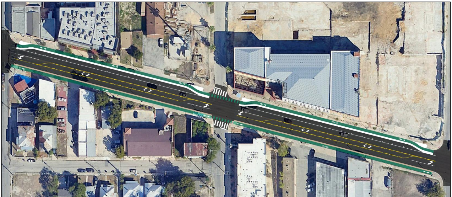
Figure 1: East Commerce Signature Project Concept

East Commerce is a major connection on the primary network on the East Side of San Antonio, connecting downtown to Salado Creek Greenway. It features an already grade-separated crossing of a rail line and most of the roadway has ample width to feature a striped bike facility without a lane reduction. It also sits on San Antonio’s Vision Zero High Injury Network. East Commerce was selected as a signature project to show how bike facilities can be deployed using new design guidance. As the roadway is an arterial and falls in a high-density area, a protected bike lane is the most appropriate facility for deployment. The existing roadway section consisted of a 75-ft right-of-way (ROW) with 42-ft Roadway (two 10-ft lanes, two 11-ft lanes) two 8-ft parallel parking lanes, and 6-ft and 11-ft Curb & Sidewalks. To accommodate the new facility, the existing section was improved to the following potential new section (75-ft ROW with 33-ft Roadway, two 11-ft lanes, an 11-ft two-way left turn lane (TWLTL), one 8-ft parallel parking lane, two 6-ft Bike Lanes, two 3-ft Bike median/ buffer zones, and 6'-11' Sidewalks on either side) (Figure 1).